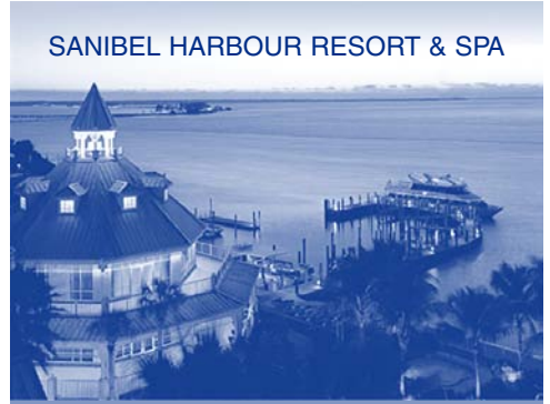
SANIBEL HARBOUR RESORT & SPA